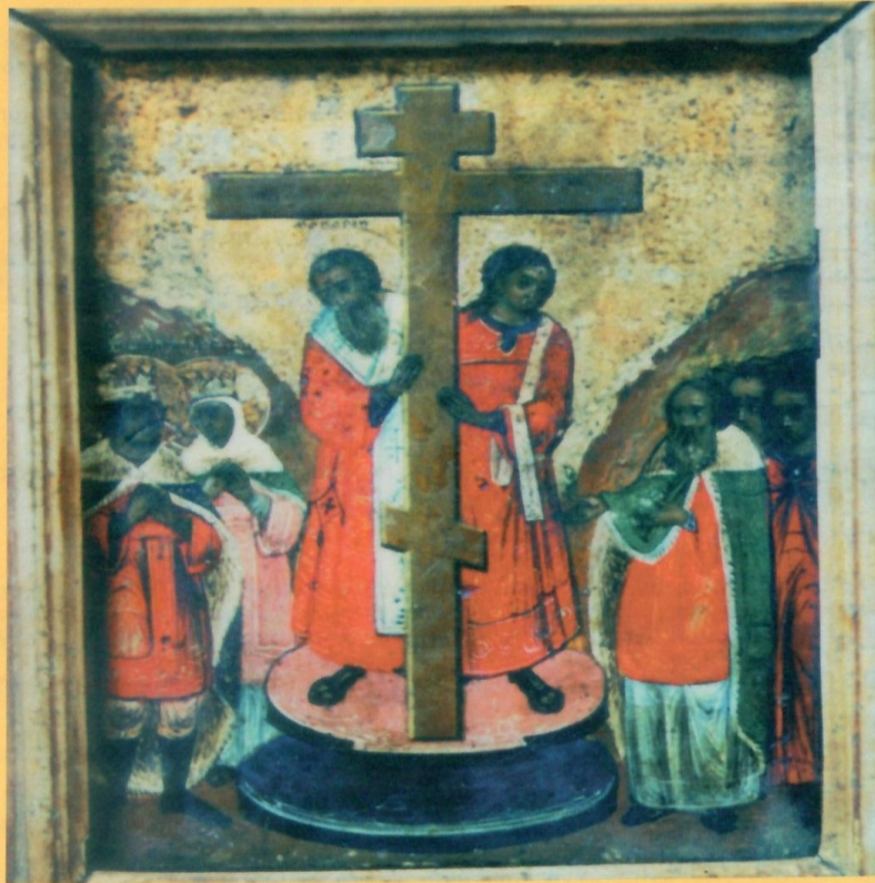
Icon of the Exaltation of the Holy Cross – September 13th