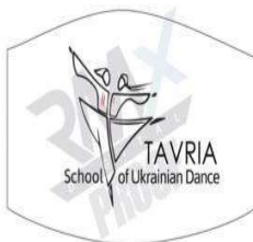
Tavria Logo Option

Masks are 100% polyester, doubled layered with a slit for a filter.