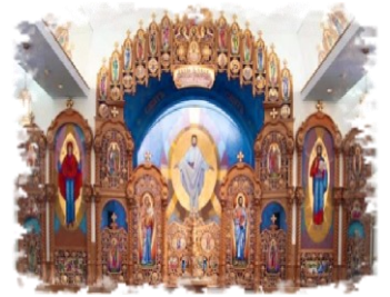
St. Basil Church