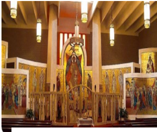
St. Athanasius Church

Welcome back! We are looking forward to beginning our adult faith formation program for the 2020-21 year! This year may look a bit different, but we are grateful that we can begin gathering again. Our program has been altered to meet current Covid 19 guidelines and safety regulations.