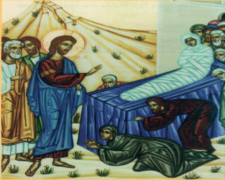
Icon of Jesus Raising the Widow's Son