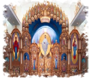
St. Basil Church

Nov 14 (St. B), Dec 12 (St. B), Jan 30 (St. A.), Mar 13 (St. B), Apr 24 (St. A) May 29 (St. A)