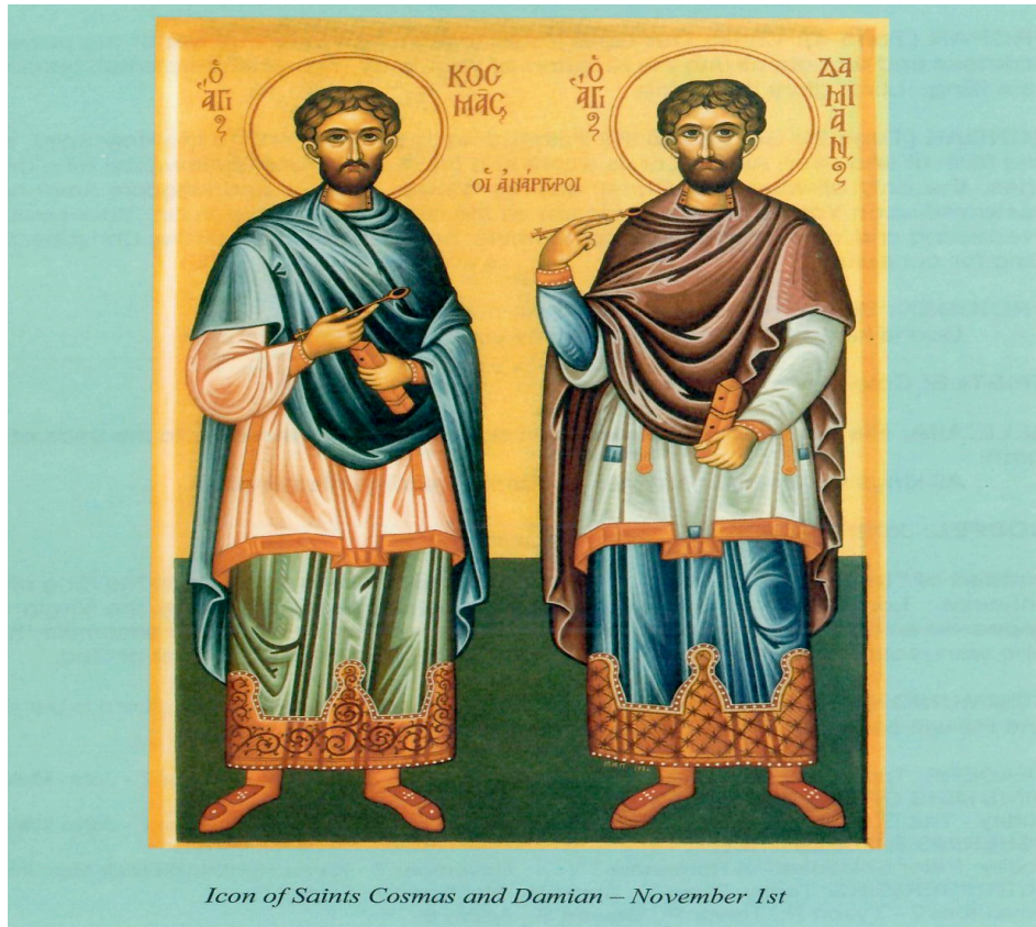
Icon of Saints Cosmas and Damian – November 1st