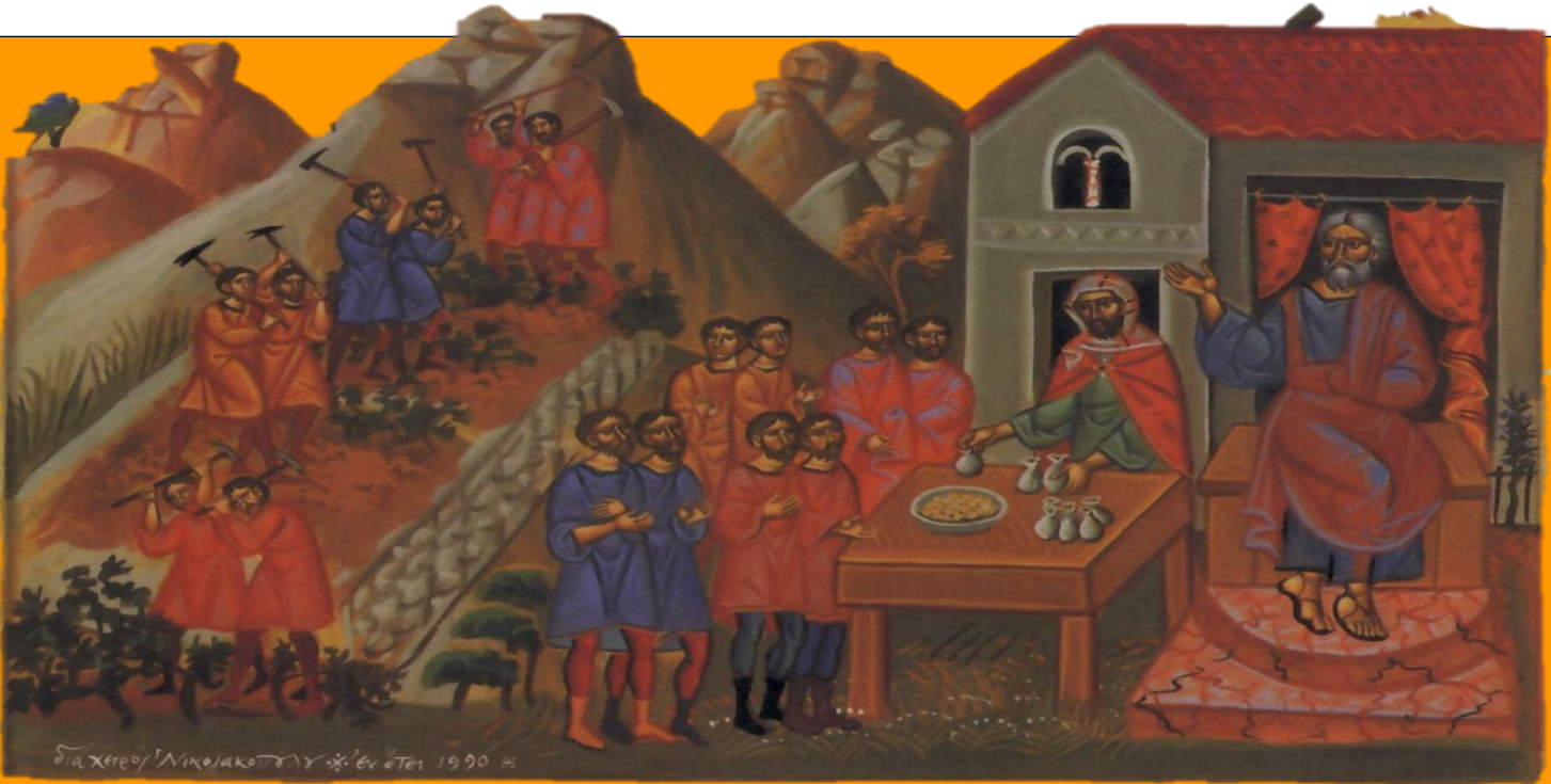
Icon of Parable of the Tenants and the Vineyard