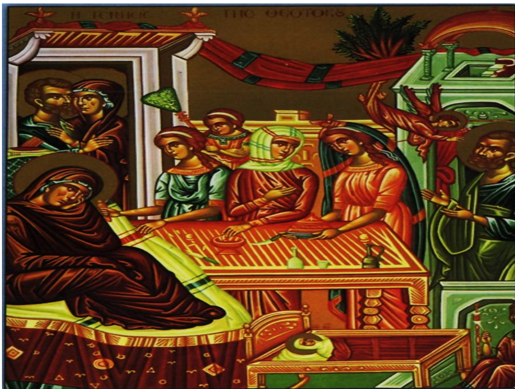
Icon of the Nativity of the Theotokos----September 8th

We shall never cease to hymn to you as one should, O Theotokos, and say: Hail, O Bride and Maiden ever-pure! Hail, O you, through whom Joy will shine forth! Hail, O you, through whom the curse will disappear! Hail, O Restoration of the Fallen Adam! Hail, O Redemption of the Tears of Eve! Hail, O Peak above the reach of human thought! Hail, O Depth even beyond the sight of angels. Hail, O you who have become a Kingly Throne! Hail, O you who carry Him Who Carries All! Hail, O Star who manifest the Sun! Hail, O Womb of the Divine Incarnation! Hail, O you through whom creation is renewed! Hail, O you through whom the Creator becomes a Babe! Hail, O Bride and Maiden ever-pure!