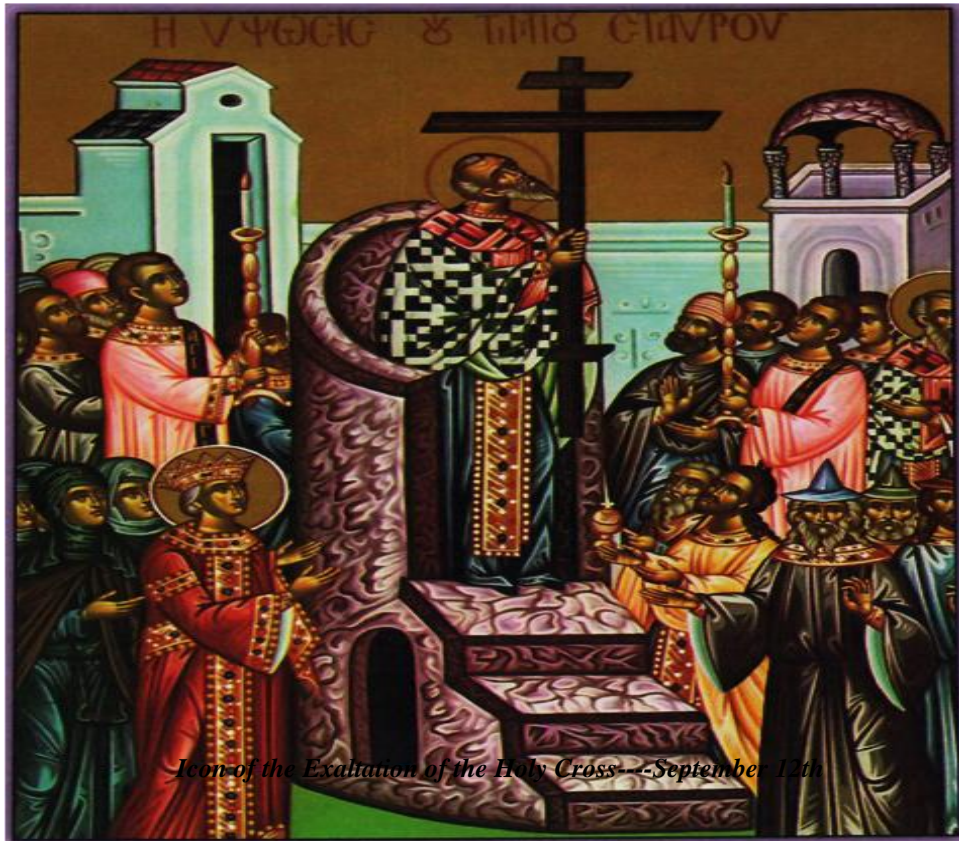
Sunday Before The Exaltation of the Holy Cross – September 12th