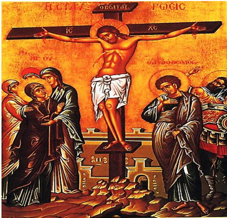
Icon of the Crucifixion of Christ