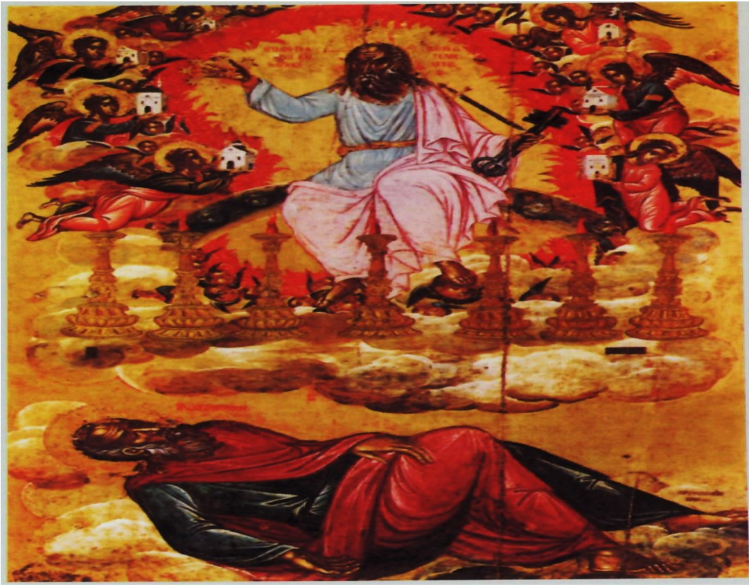
Icon of St. John and His Vision of Heaven

Then I saw a new heaven and a new earth. The former heaven and the former earth had passed away, and the sea was no more.