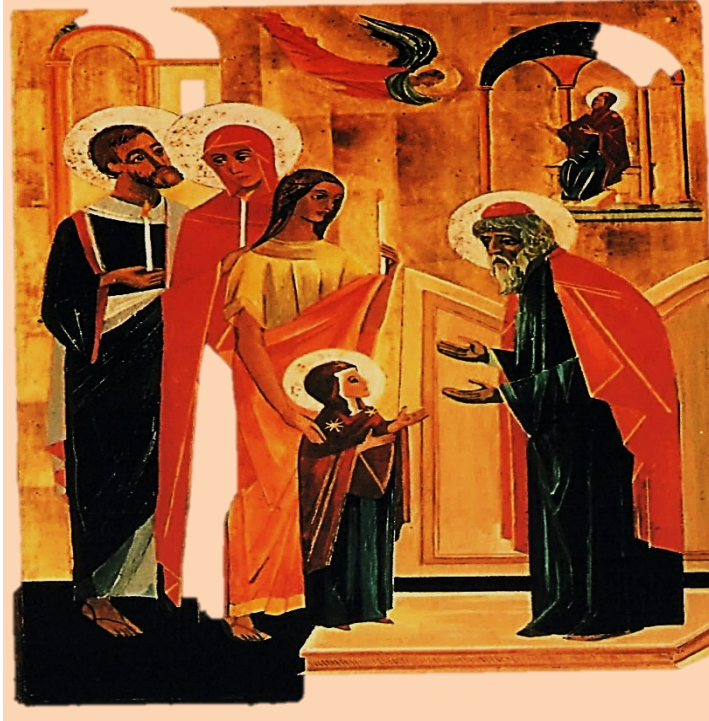
Icon of the Presentation of the Mother of God Feast of Presentation- November 21