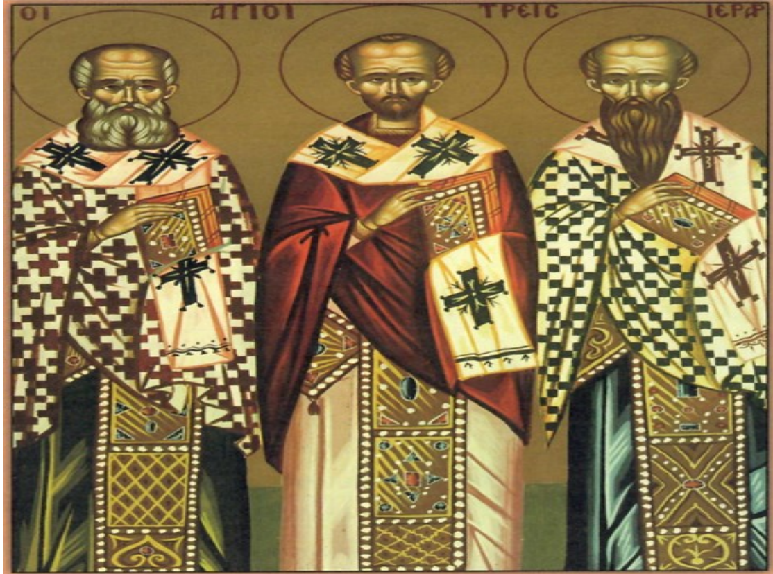
Icon of the Three Holy Hierarch – January 30th