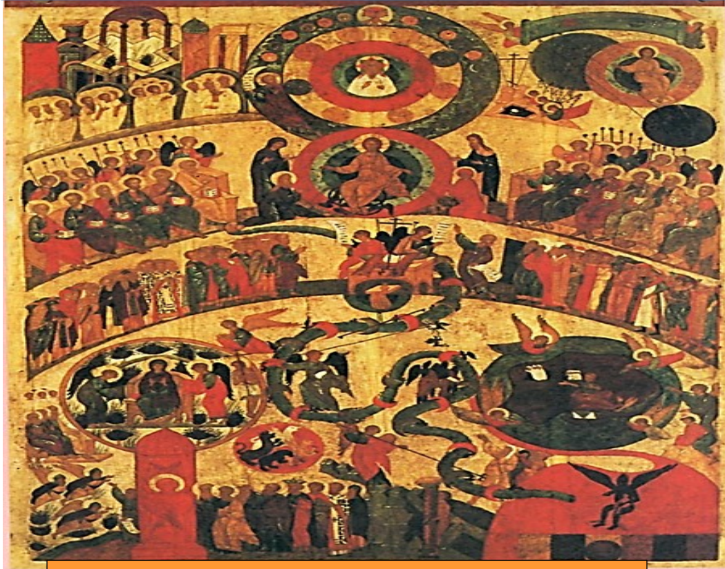
Icon Of The Last Judgment