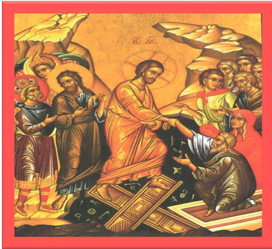
Icon of Christ Raising Adam and Eve from the Tombs