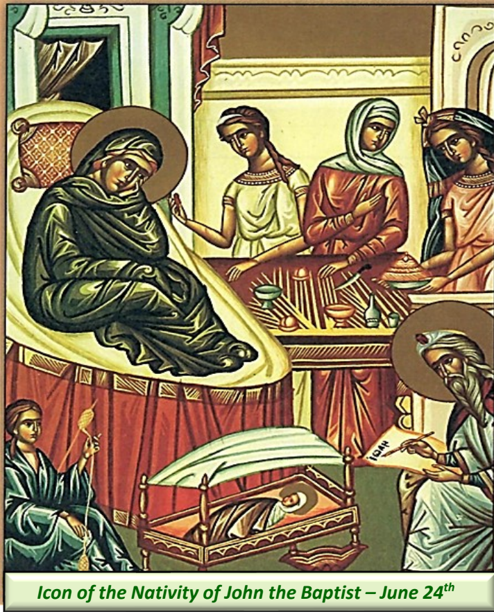
Icon of the Nativity of John the Baptist – June 24 th

The Church observes the birth of John as in some way sacred. And, you will not find any other of the great men of old whose birth we celebrate officially. We celebrate John's, as we celebrate Christ's. This point cannot be passed over in silence, and if I may not perhaps be able to explain it in the way that such an important matter deserves, it is still worth thinking about it a little more deeply and fruitfully than usual. John is born of an old woman who is barren; Christ is born of a young woman who is a virgin. That John will be born is not believed, and his father is struck dumb; that Christ will be born is believed, and He is conceived by faith.