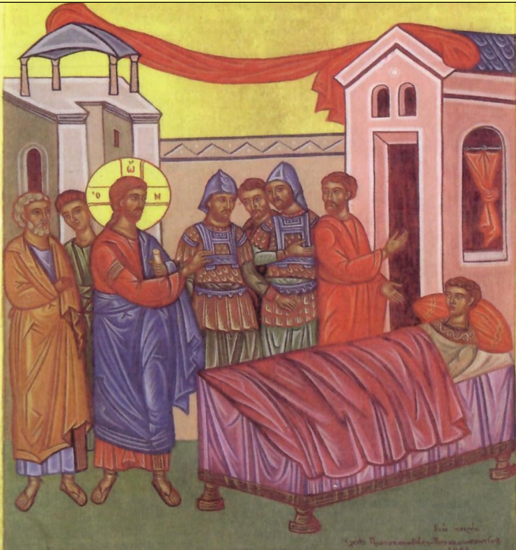
Icon of Christ Healing the Centurion's Servant (Mt. 8:5-13)

Our faith is not founded upon empty words; nor are we carried away by mere caprice or beguiled by plausible arguments. On the contrary, we put our faith in words spoken by the power of God, spoken by the Word Himself at God's command. God wished to win us back from disobedience, not by using force to reduce us to slavery, but by addressing to our free will a call to liberty.