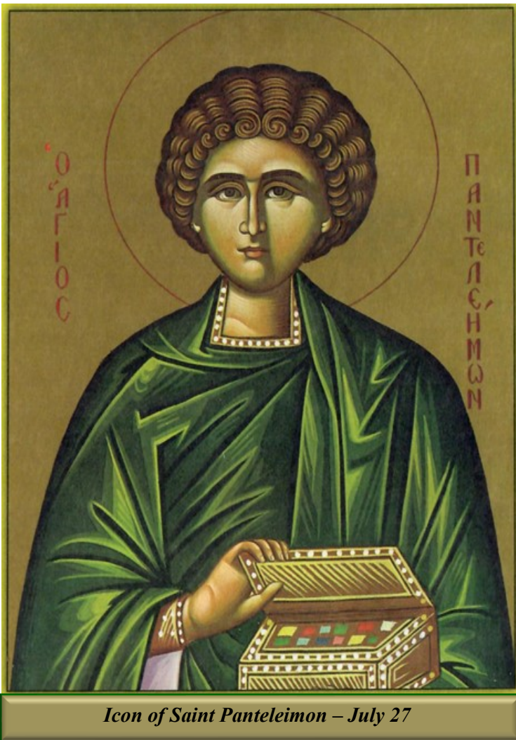
Icon of Saint Panteleimon – July 27