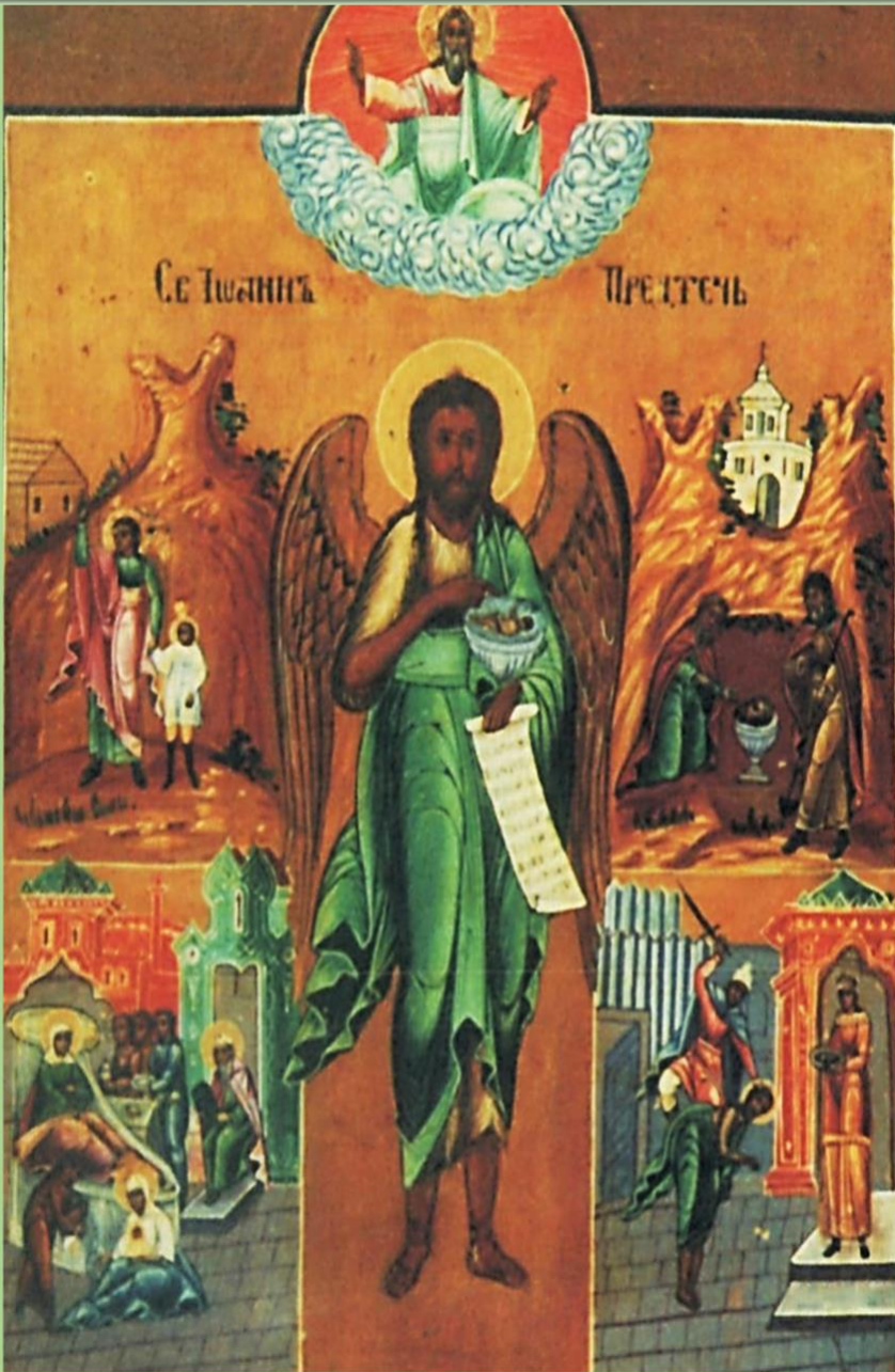
Icon of Saint John the Baptist – August 29th

Note well the weakness of the tyrant compared to the power of the one in prison. Herod was not strong enough to silence his own tongue. Having opened it, he opened up countless other mouths in its place and with its help.