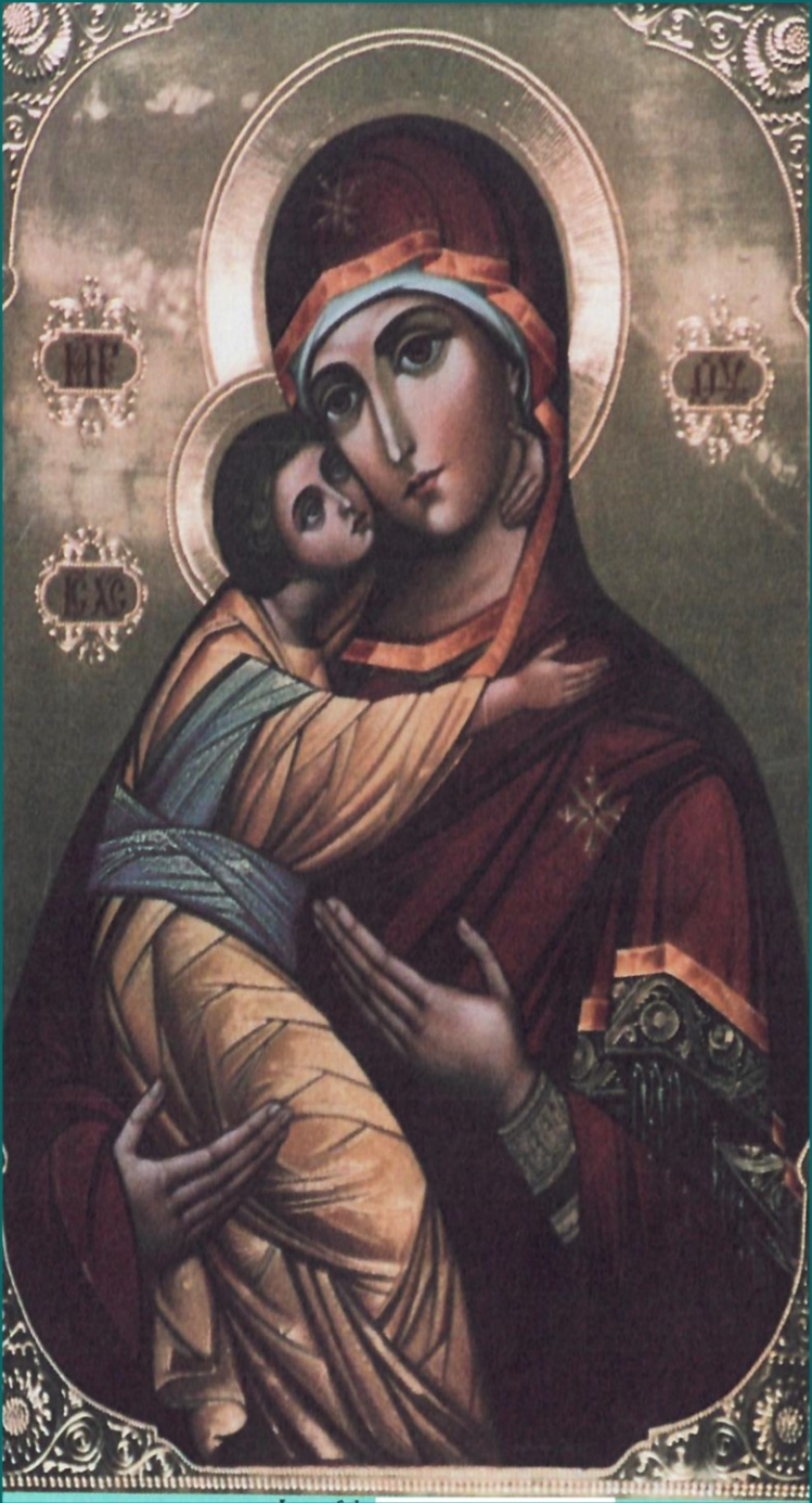
Icon of the Mother of God – Feast of the Patronage October 1 st

Happy are they who observe His decrees, who seek Him with all their hearts ... "