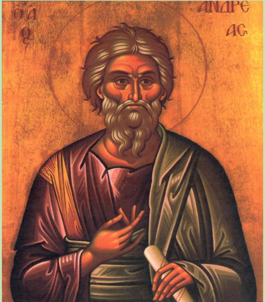
Icon of Saint Andrew – November 30th

Saint Andrew's vocation, and ours as well, wasn't given all at once, but gradually. Seven calls from the Lord built one upon the other throughout the course of his life. Andrew's response to each call gave new shape to his life and prepared him for the next gift of God. This courageous young man, by purity of heart and docile obedience to God's will became in St. Bede's words, "The Introducer to Christ." He introduced his brother to Jesus, and the Greeks and Scythians.