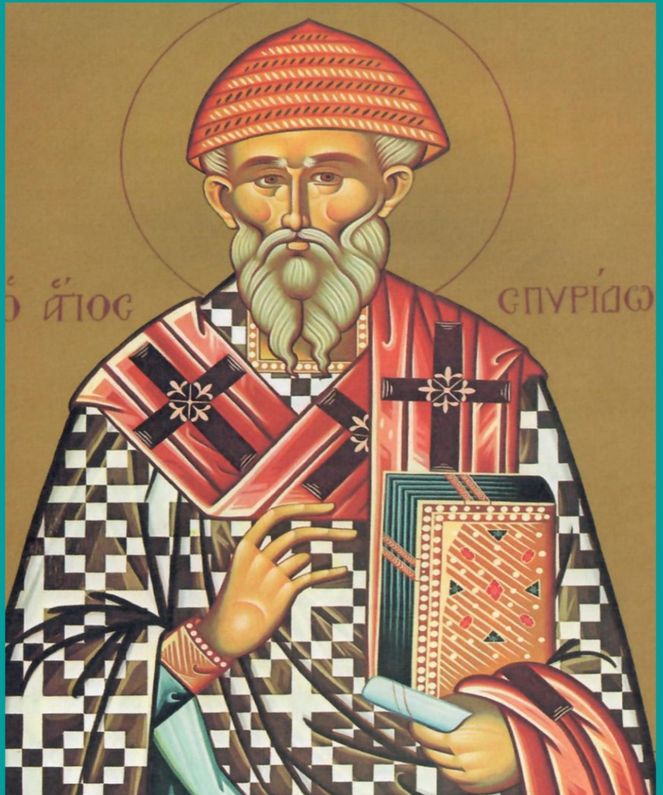
Icon of Saint Spyridon – December 12th