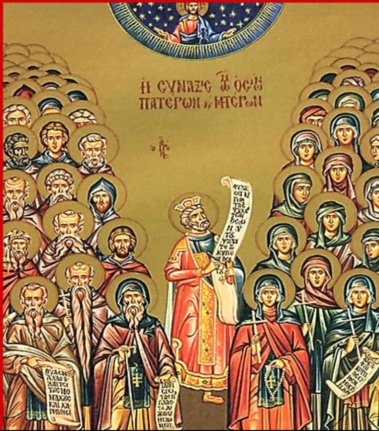
Icon of the Holy Ancestor