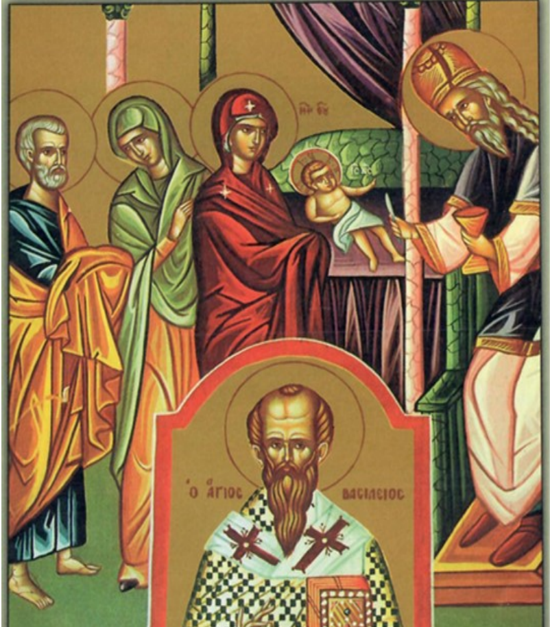
Icon of the Circumcision and Saint Basil the Great – January 1st