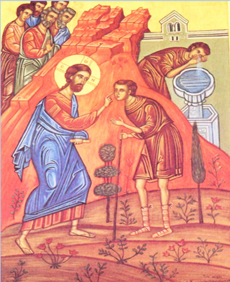
Icon of the Healing of the Man Born Blind