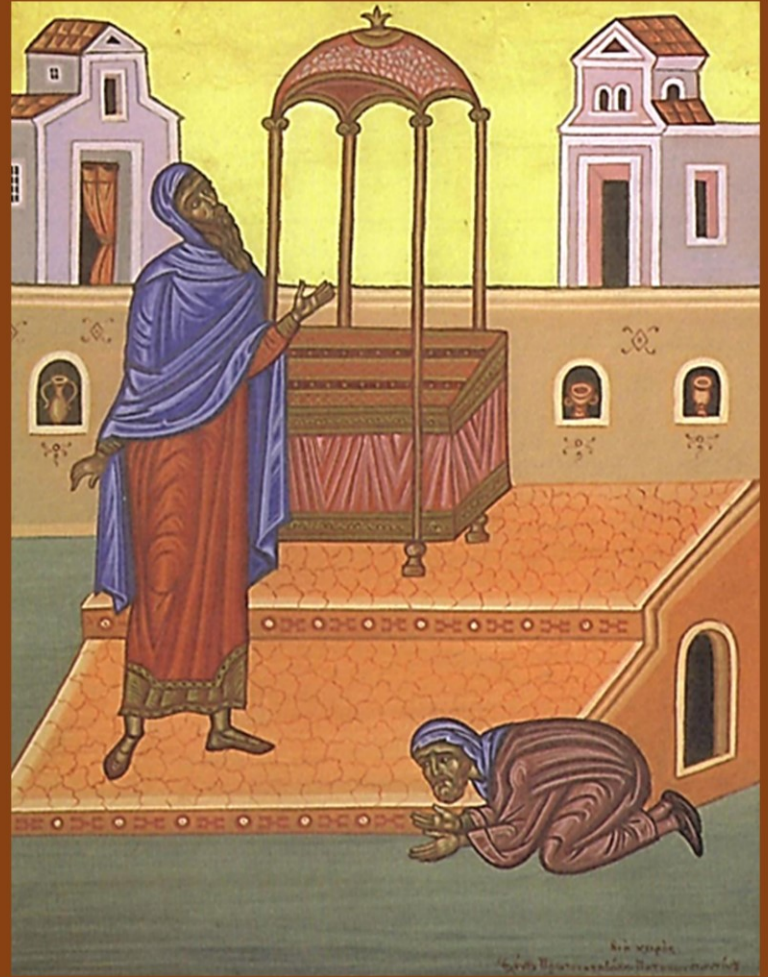
Icon of the Publican and Pharisee