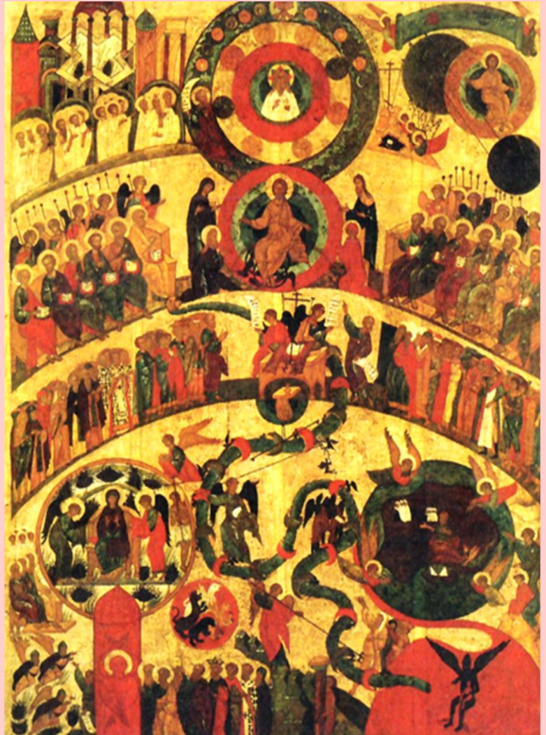
Icon of the Last Judgment