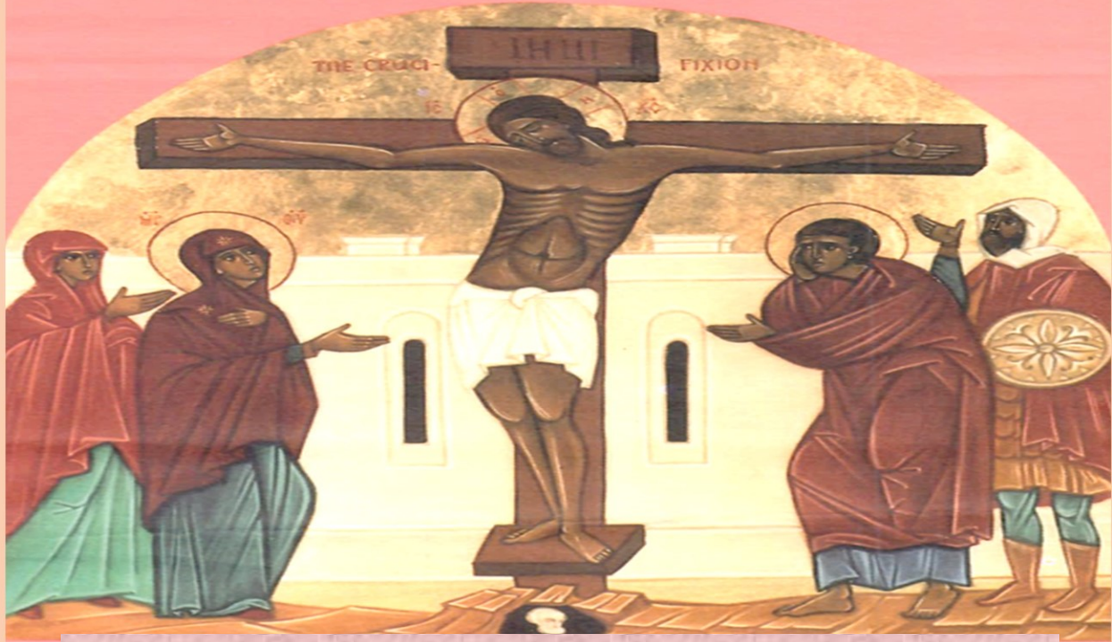
Icon of the crucifixion scene