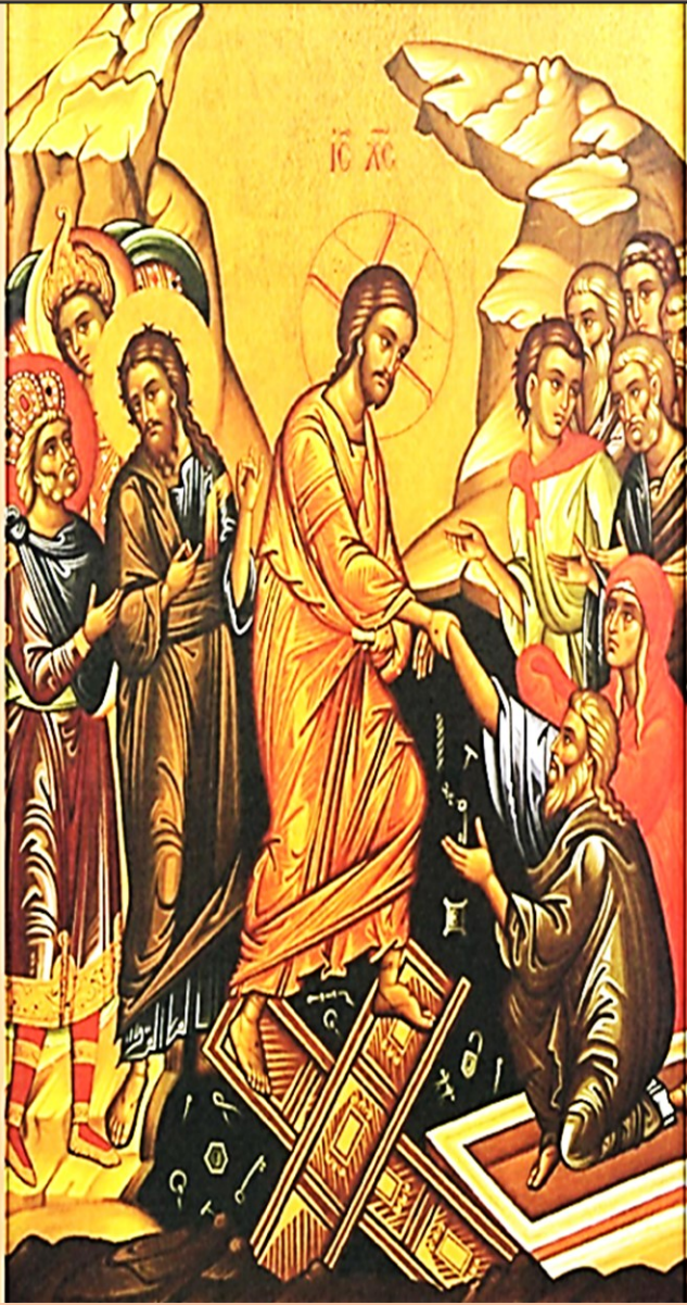
Icon of Christ Raising Adam and Eve from the Tombs