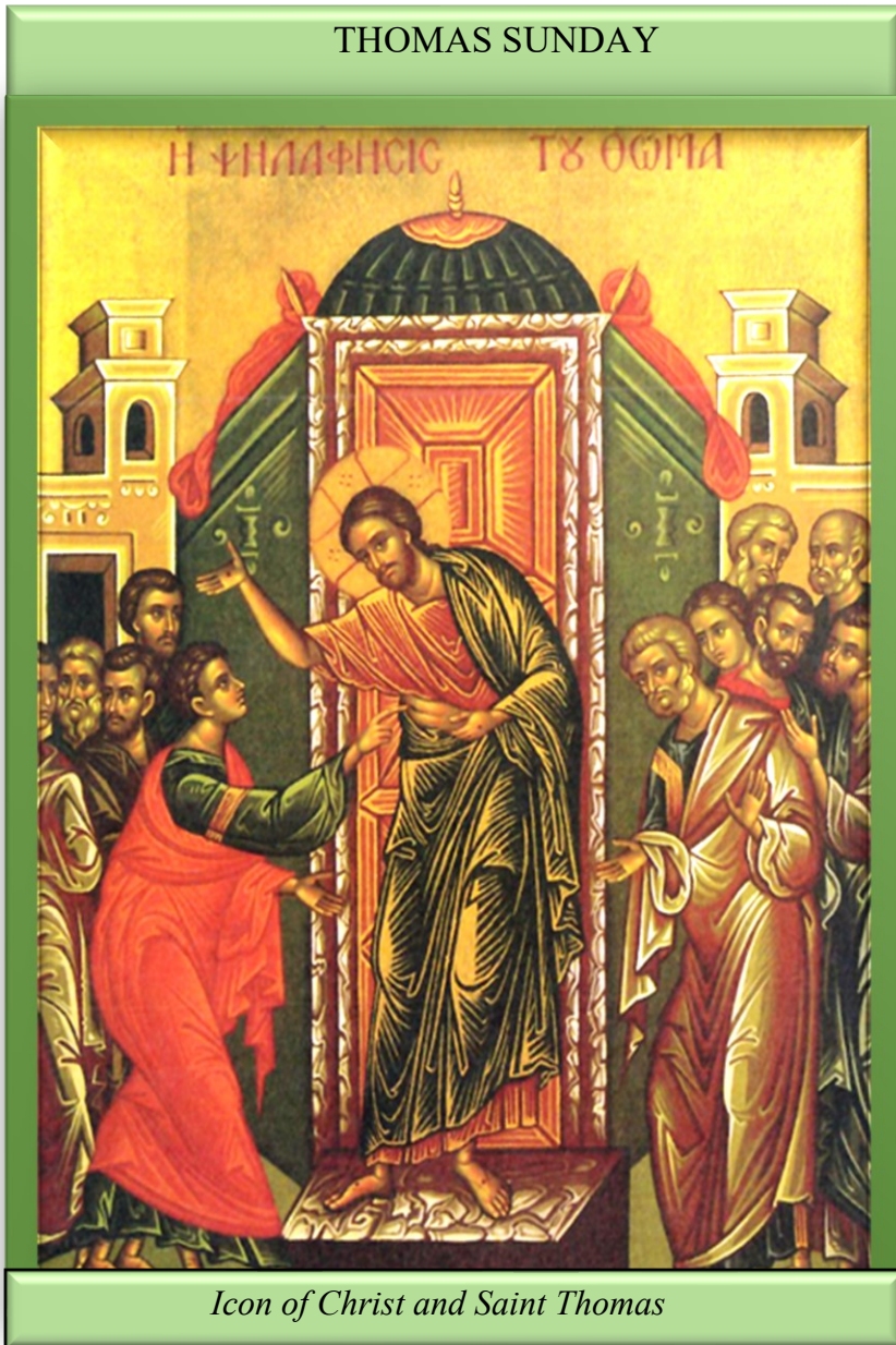
Icon of Christ and Saint Thomas