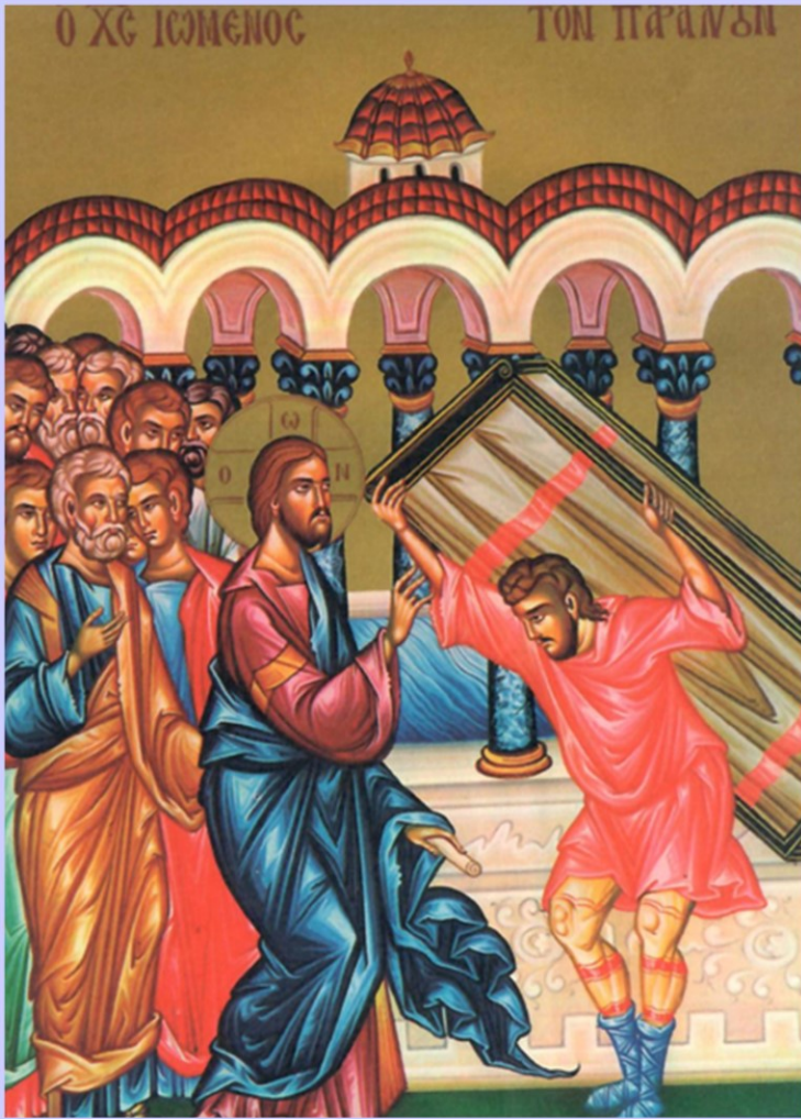
Icon of Jesus healing the Paralytic Man