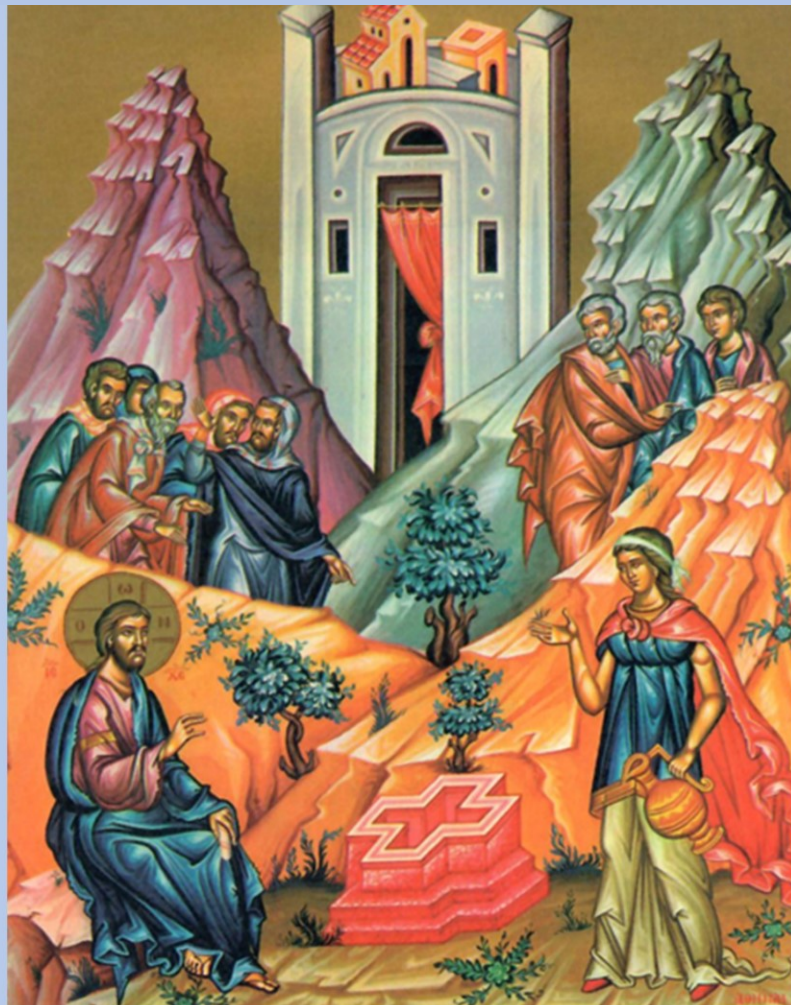
Icon of Christ with the Samaritan Women