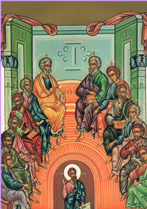
Icon of Pentecost