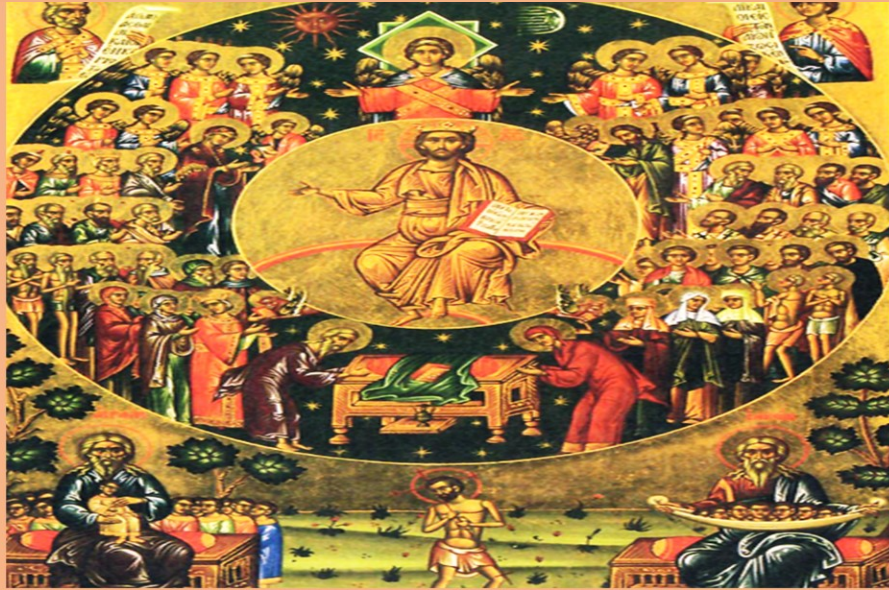
Icon of All Saints