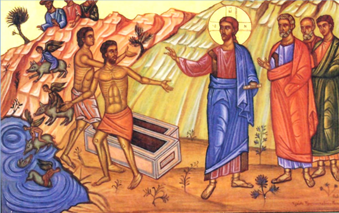
Icon of the Healing Gadarene Demoniacs

The whole warfare of the demons against us is waged with the one purpose of alienating those who obey them from the glory of God and the grace of the Holy Spirit. But, as I see it, we have already deprived ourselves of such a gift before they even attack us, because we have forsaken the commandments of God and have not been eager to seek Him with all our soul. Had we sought Him we should not have lived so idly and carelessly! Had we been concerned for the things of heaven we should not have shown such great eagerness for the things of earth. Had our thoughts been on things incorruptible we should not have gaped greedily after the things that are transitory and corruptible.