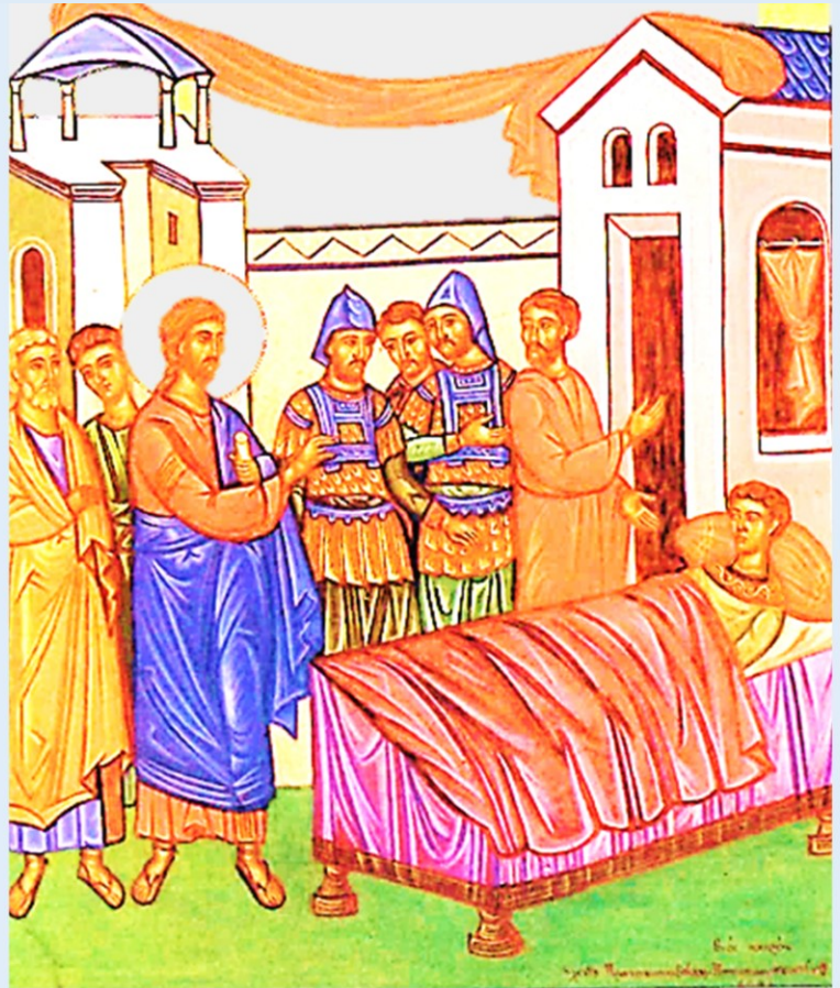
Icon of Christ Healing the Centurion's Servant