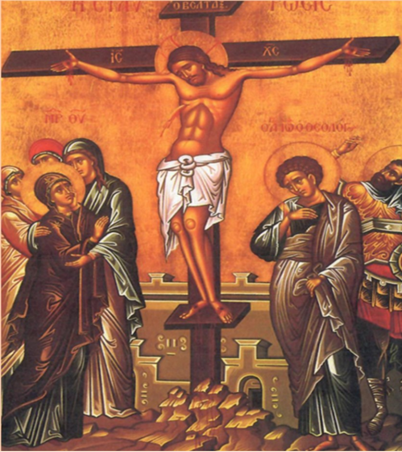
Icon of the Crucifixion of Christ