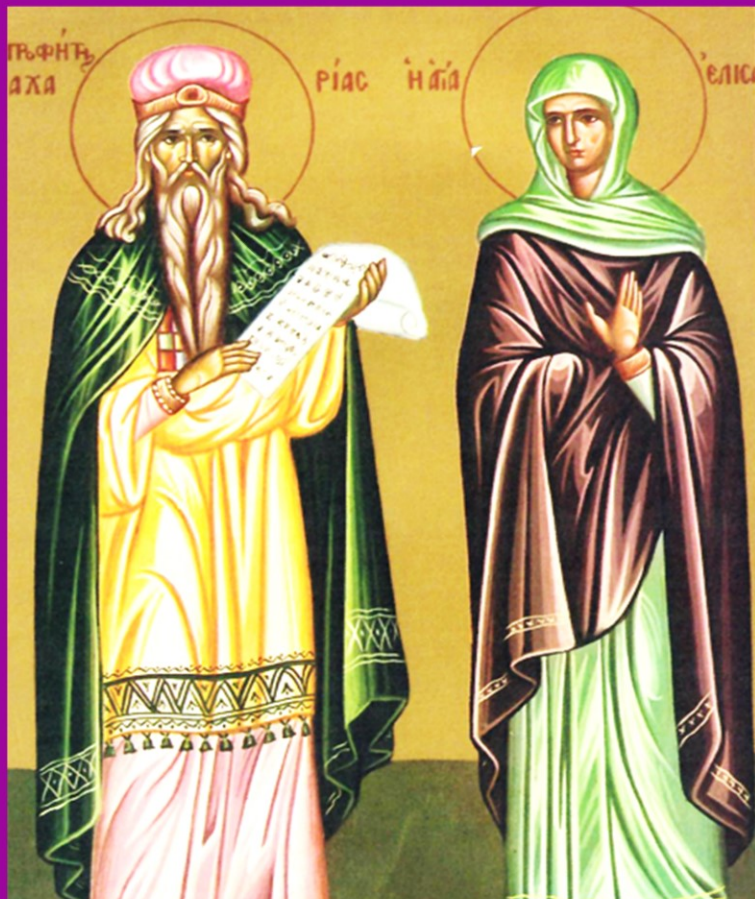
Icon of Zachary and Elizabeth, Conception of St. John the Baptist – September 23rd

Marriage is the representation of an important reality. It is a representation of Jesus Christ and the Church. It is a mystery, and the mystery consists in this, the fact that the spouses are united and the two become one. In great silence, while all around them there is complete tranquility, the two are united and together form the image of God. One meets the other to make one body.