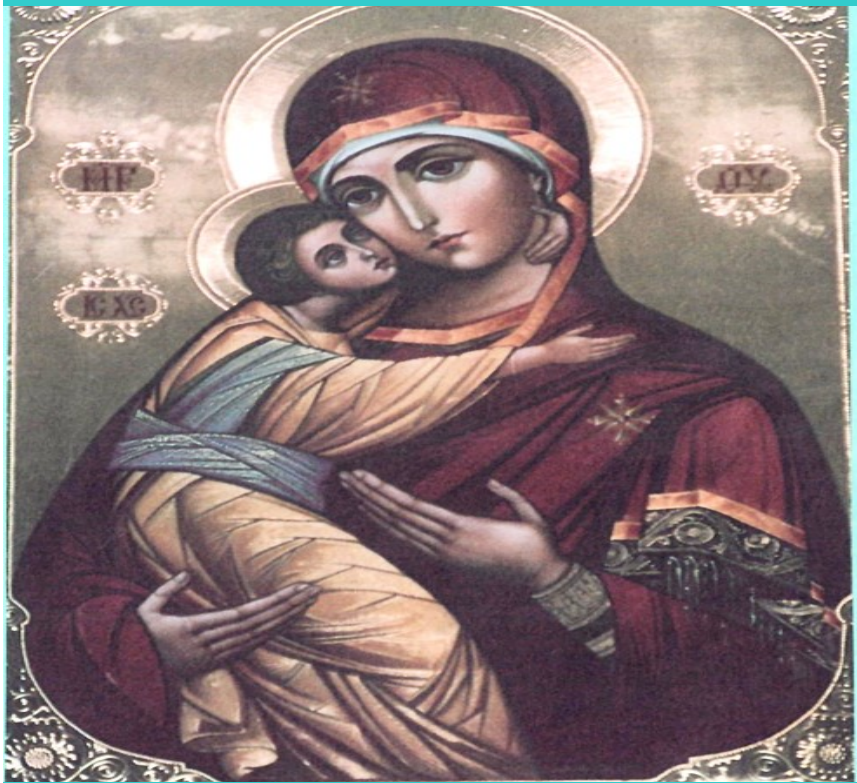
ICON OF THE MOTHER OF GOD

Psalms 119 gives us a taste of happiness with God. "They are happy whose life is blameless, who walk in the law of the Lord. Happy are they who observe His decrees, who seek Him with all their hearts ... "