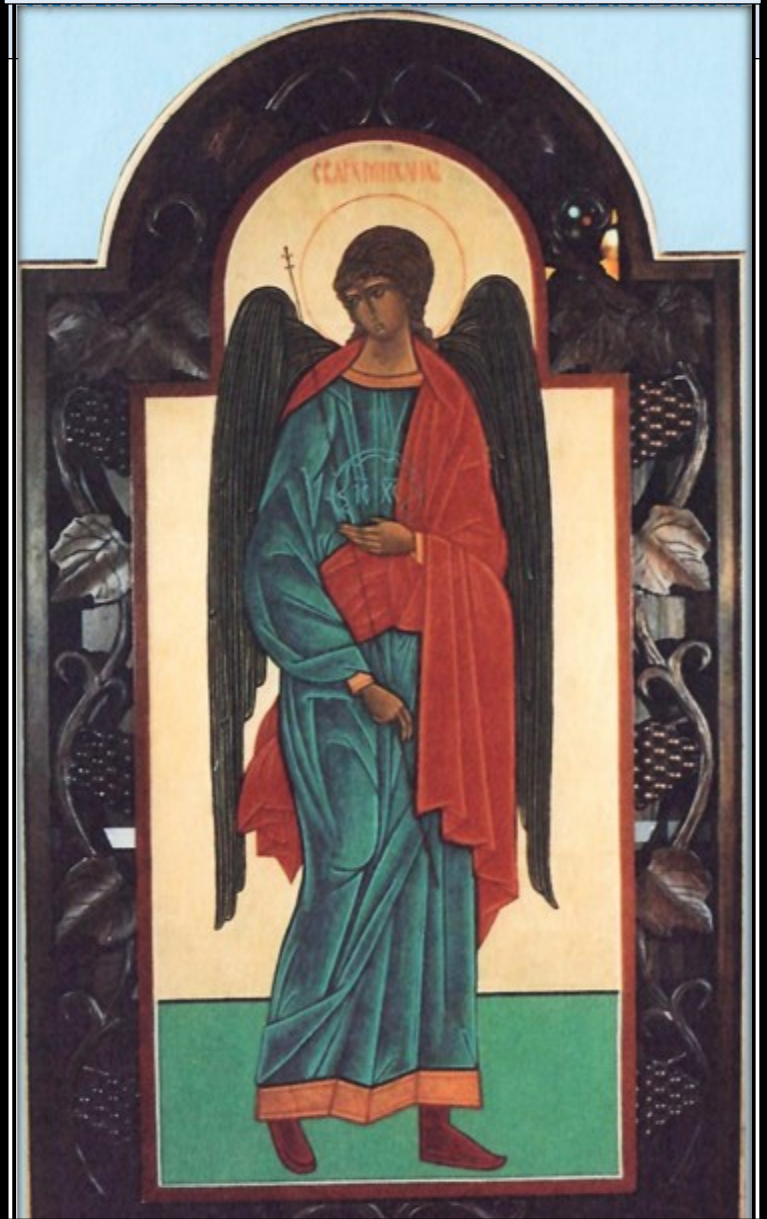
Icon of St. Michael the Archangel Feastday: November 8