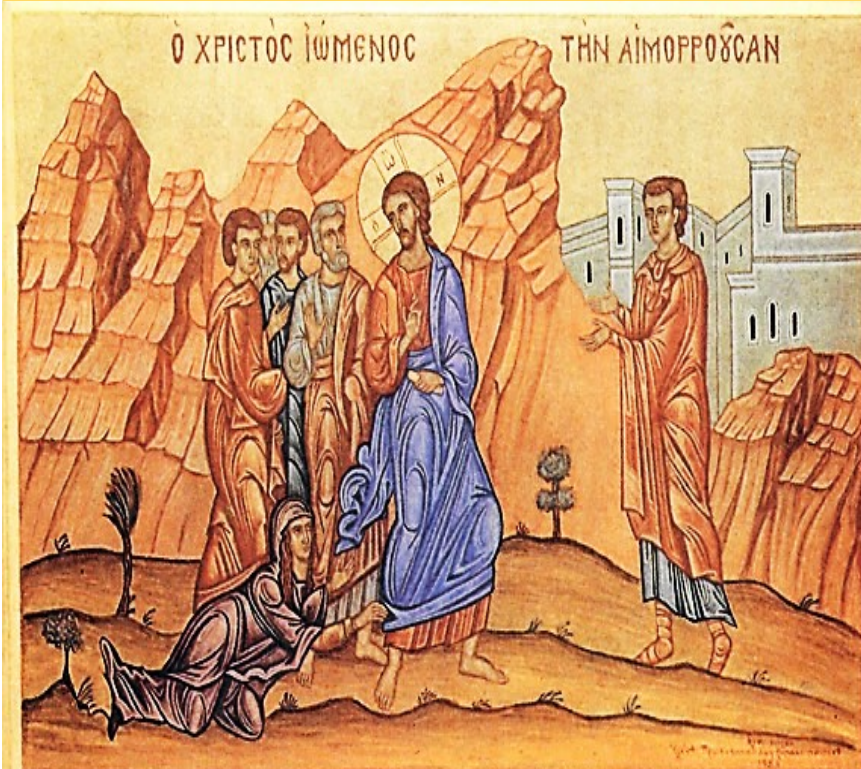
Icon Of The Healing Of The Woman With A Hemorrhage

When things go well, our hearts are lifted up. When adversary strikes, the heart is made humble. In prosperity the soul is interested in self; in difficulties, it becomes mindful of God.