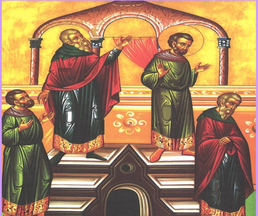
Icon of the Publican and Pharisee