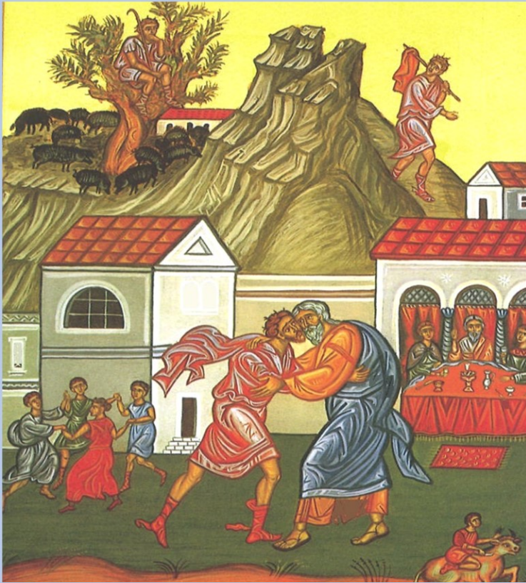
Icon of the Prodigal Son