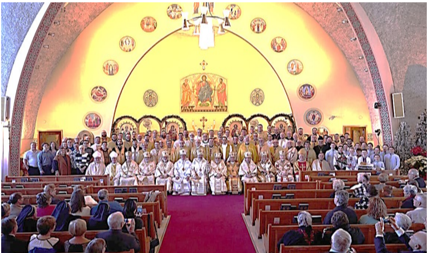
BISHOP SMOLINSKI CONSECRATION