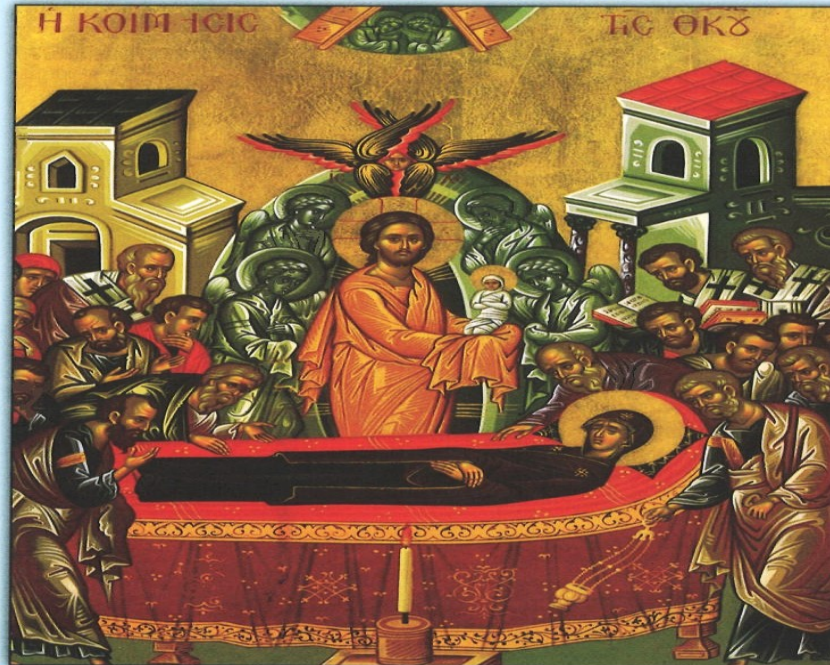
Icon of the Dormition of the Theotokos