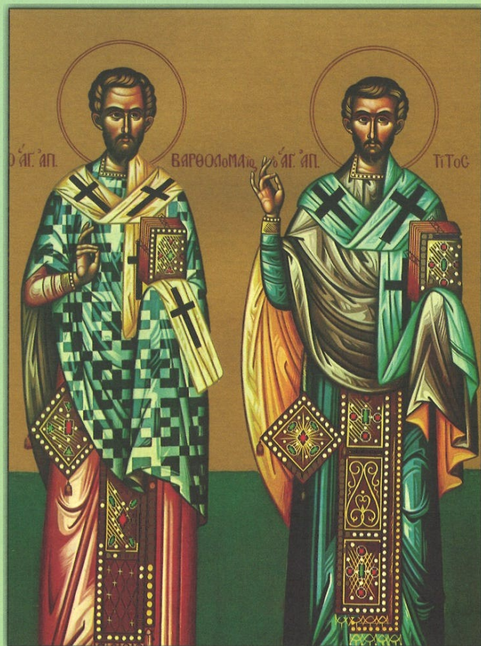
Icon of Saint Bartholomew and Titus—August 25 th