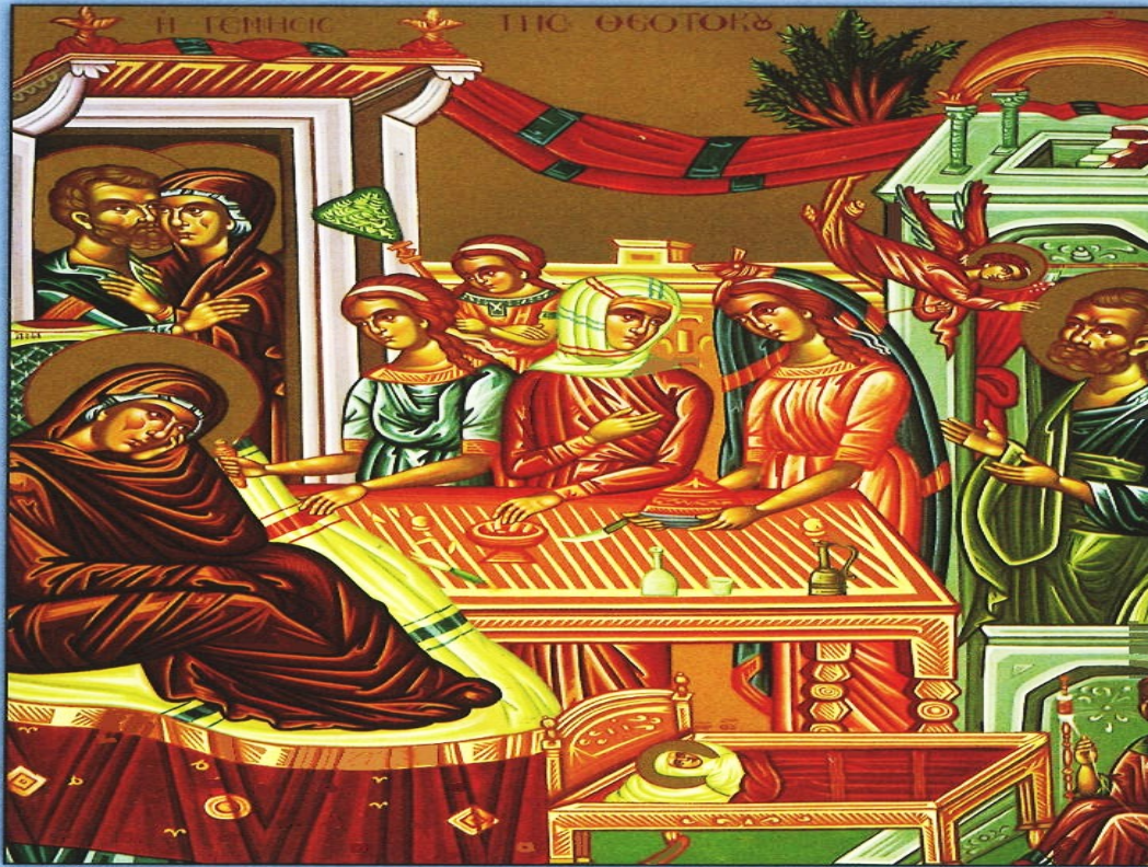
Icon of the Nativity of the Theotokos—September 8th

We shall never cease to hymn to you as one should, O Theotokos, and say: Hail, O Bride and Maiden ever-pure!