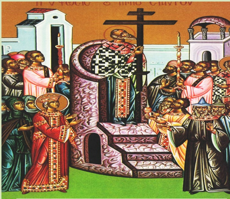
Icon of the Exaltation of the Cross – September 14th