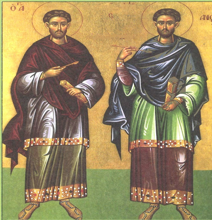
Icon of Cosmas and Damian - November 1st