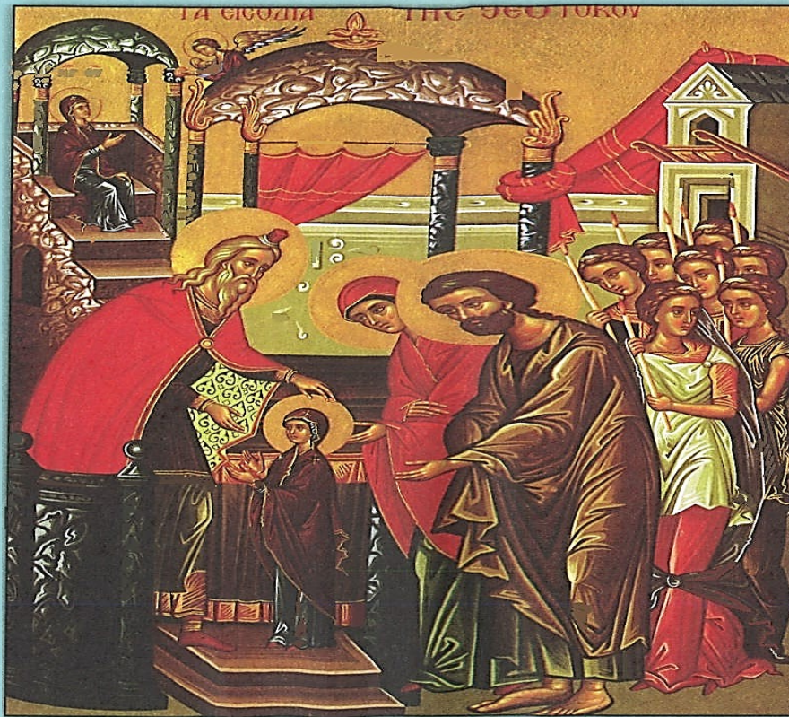
Icon of the Entrance of the Theotokos into the Temple – November 21st