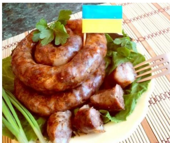
Garlic or Ham Flavors