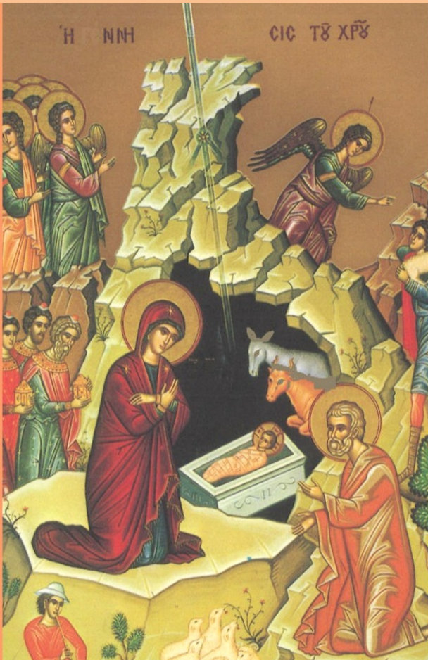
Icon of the Nativity of Our Lord