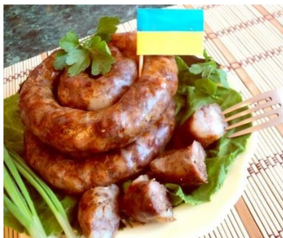
Garlic or Ham Flavors